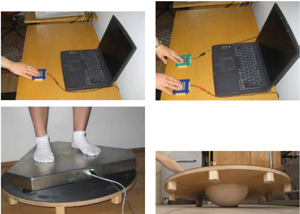
Figure 1: Task execution – responding on either one or two visual stimuli provided concurrently with keeping the balance platform horizontal, or as close to horizontal as possible

Simultaneously, the COP velocity was registered at 100 Hz by means of the FiTRO Sway Check posturography system, based on dynamometric platform. Subjects were instructed to minimize postural sway by standing as still as possible. Average values of 5-second intervals were used for the analysis.